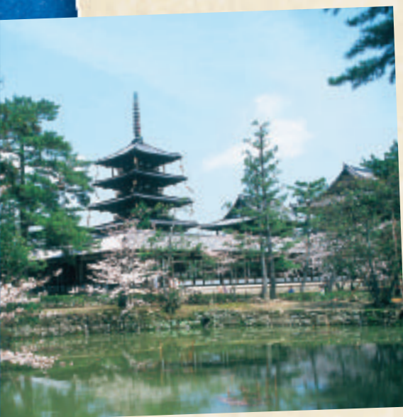
▲ The Horyu-ji temple, built by Prince Shotoku